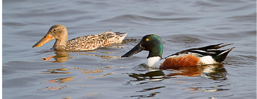
A pair of Northern Shovelers with the male in breeding plumage at Horicon National Wildlife Refuge (May, 2010). Keith Kennedy