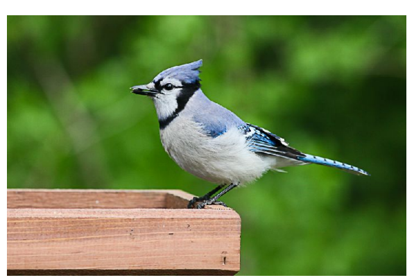
Blue Jays frequently 'hit' the a tray feeder vs. a tube feeder.

Please renew your Hoy Audubon Chapter Membership for 2010/2011. Renewals for our new year are due by July 1 but don't wait, do it now!