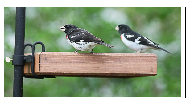
Consider adding a tray feeder to your back yard feeding area. Many birds seem to prefer the tray to a traditional tube feeder. Plus, trays are easy to clean on a regular basis.