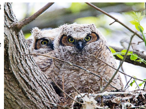
Great Horned Owlets at Colonial Park.

been the presence of a Great Horned Owl nest with two owlets. The nest is located about 15 feet off the ground in a tree at the entrance to the Park. As of mid-May, both owlets, still sporting a lot of fuzz, were seen out of the nest and sitting on adjacent branches. Participants on our May 15 Saturday morning warbler walk got to see the mother