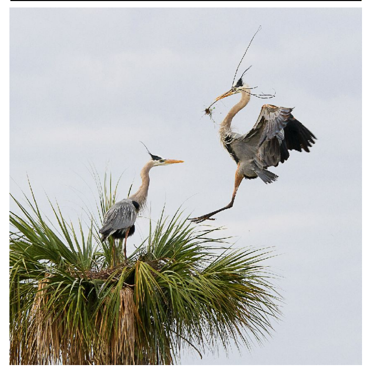
Spring is on the way! As of late February, Great Blue Herons are building nests at Viera Wetlands near Melbourne, Florida. Be sure to stop by this little known birding hotspot if you are near Florida's Space Coast.

Note that nominations (including self-nomination) of people interested in serving on the board may be made from the floor.