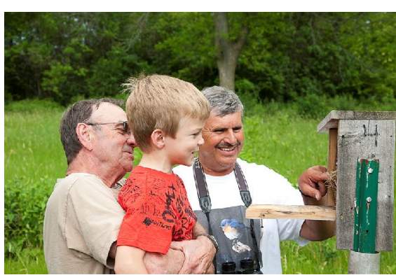
Checking a bluebird box for eggs!

Send to: Hoy Audubon Society, P. O. Box 044626, Racine, WI 53404