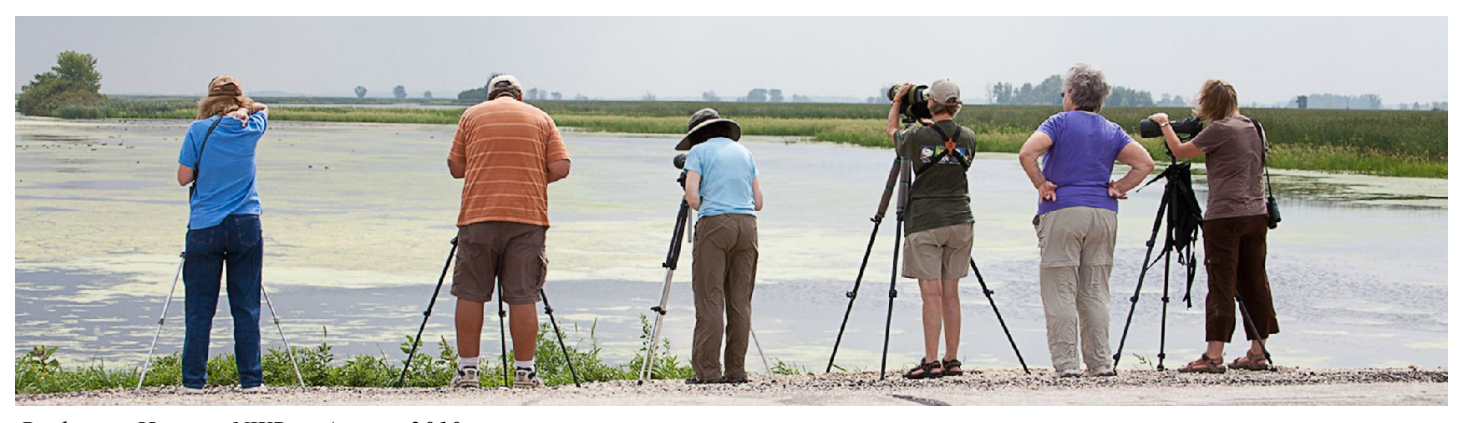
Birding at Horicon NWR in August, 2010.

Please take the time to renew your Hoy Audubon Chapter Membership for 2010/2011. Annual renewals for Hoy Audubon Society "Chapter Supporter" memberships are due on July 1 of each calendar year. Please send a check payable to Hoy Audubon Society. Chapter Supporter Dues: $12 Total amount enclosed: ______ Receive chapter newsletter by email only? Yes, my email is: ______