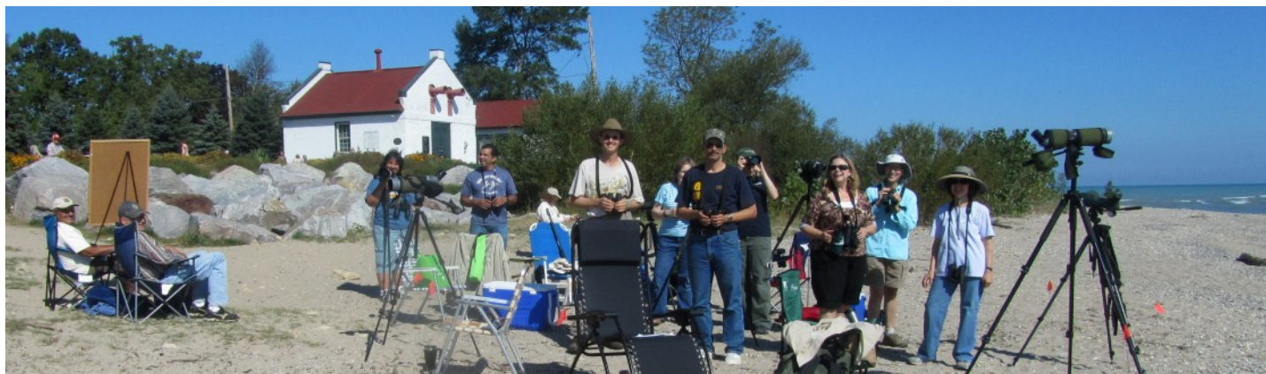
Birding at Hoy's first Big Sit-On the Beach at Wind Point-September 2011.

HOY AUDUBON SOCIETY P.O. BOX 044626 RACINE, WI 53404 www.hoyaudubon.org