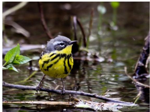
Magnolia Warbler at Nicholson Spring 2011

Of note, during the 2011 spring season, Nicholson was an exceptionally good area to see spring migrants up close. Good numbers of warblers were seen along the trails close to the stream. In springtime, you'll need at least knee-high boots to hike through the flooded trail to get to the main pond.