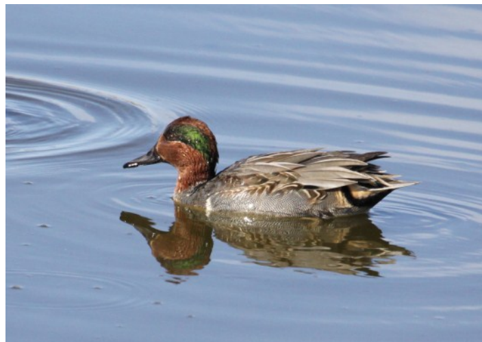
Green Winged Teal-One of the ducks that will be helped by your purchase of a duck stamp!