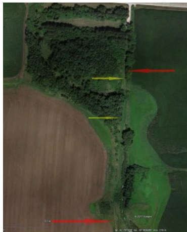
The arrows represent the flooded area: yellow= minimum, red = maximum

plantings, a viewing blind, and raptor perches. In order to do any of this we need a boardwalk to bridge the wettest areas.