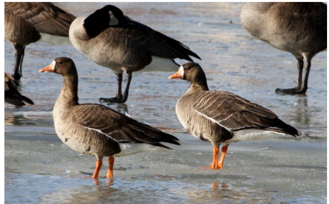
Greater White Fronted Geese -Jenny Wenzel

Of note, during the 2011 spring season, Nicholson was an exceptionally good area to see spring migrants up close. Good numbers of warblers were seen along the trails close to the stream. In springtime, you'll need at least knee-high boots to hike through the flooded trail to get to the main pond.