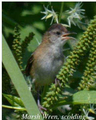
Marsh Wren, scolding

We were joined briefly by a birder from Israel whom a couple of us had met the day before, when he had been quite