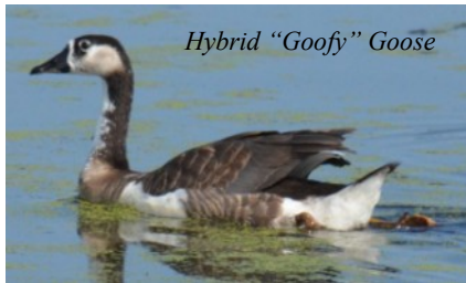
Hybrid "Goofy" Goose

This year we saw relatively few Pelicans anywhere, though we did tern up (ha!) quite a number of Black Terns. The Fond du Lac side was a haven for shorebirds: Lesser Yellowlegs; Pectoral, Semipalmated, Least, and Stilt Sandpipers; and of course the ever-present Killdeer and too-distant-to-identify Peep species. A handful of less common shorebirds also cropped up: two Short-billed Dowitchers, three Baird's Sandpipers, one White-rumped Sandpiper, and ten Black-bellied Plovers (Lifer #267 for the author).