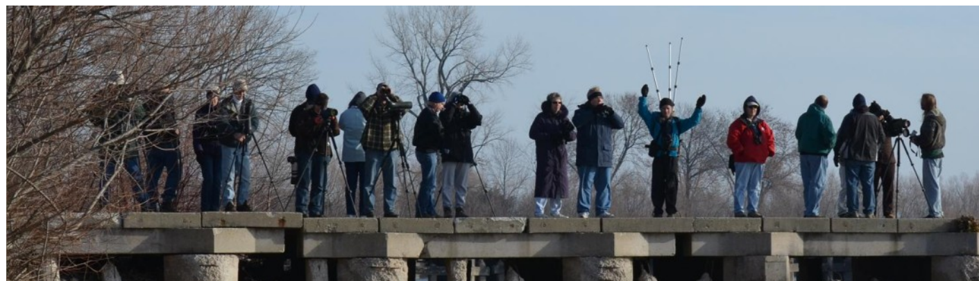
Novembrrrrrr Birding at Shoop Park, November 2012