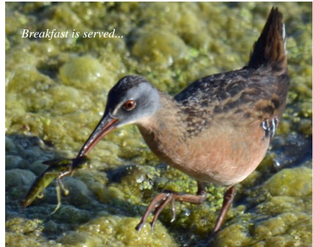
Breakfast is served...

Sunday began with more Route 49 birding and a much larger crowd of birders, since the WSO group was assembling. Few shorebirds came close to the crowd, so we were surprised to find a Virginia Rail a mere seven or so feet from the road! It popped in and out of the grasses as it pecked like a chicken at the algae mat. Upon spotting a particularly juicy darter larva, it darted far out into the open, much to the delight of all the photographers. How could this get any better?