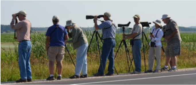
Roadside Birding on Route 49