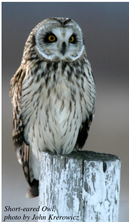
Short-eared Owl

Over 232 species of birds have been reported at Bong (via ebird.org) and over 100 species can be found within the park during nesting season. Examples of this wide variety of Summer nesting birds include Henslow's, Savannah, Field, Vesper, and Clay-colored Sparrows. Other field birds include Eastern Meadowlark, Bobolink, Sedge Wren, and Upland Sandpiper. The winnowing call of the Wilson's Snipe can be heard from Spring through early summer as can the peenting of the American Woodcock. Orchard Orioles can often be found in the large oak trees near the visitor center. The marsh areas within the park provide nesting sites for Sora and Virginia Rails, various ducks, Black Terns, Yellow-headed Blackbirds, American and Least Bitterns, and Marsh Wrens.