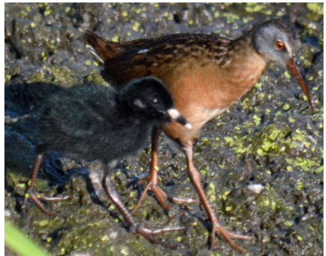
Horicon Lesson #3: Never stop looking!

We then heard soft peeps, and the Rail emerged with three fluffy black chicks in tow. Their legs were nearly full-length but their bills were much shorter, with a black stripe in the center similar to the Ring-billed Gull's ring. This merry, squeaking parade set off around the perimeter of the algae mat to seek shelter in the deeper cattails.