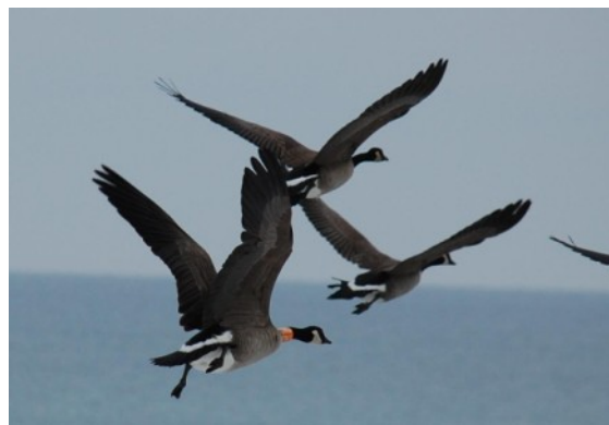
Banded Canada Goose, Racine CBC 2011

Send to: Hoy Audubon Society, P. O. Box 044626, Racine, WI 53404