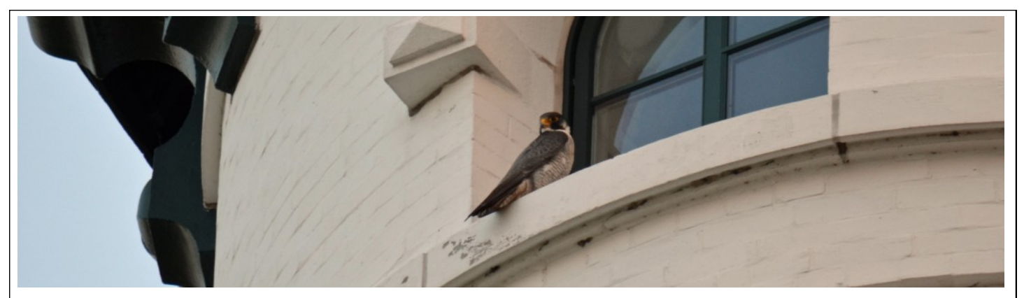
Peregrine Falcon perched on the Wind Point Lighthouse, May 2013

HOY AUDUBON SOCIETY P.O. BOX 044626 RACINE, WI 53404 www.hoyaudubon.org