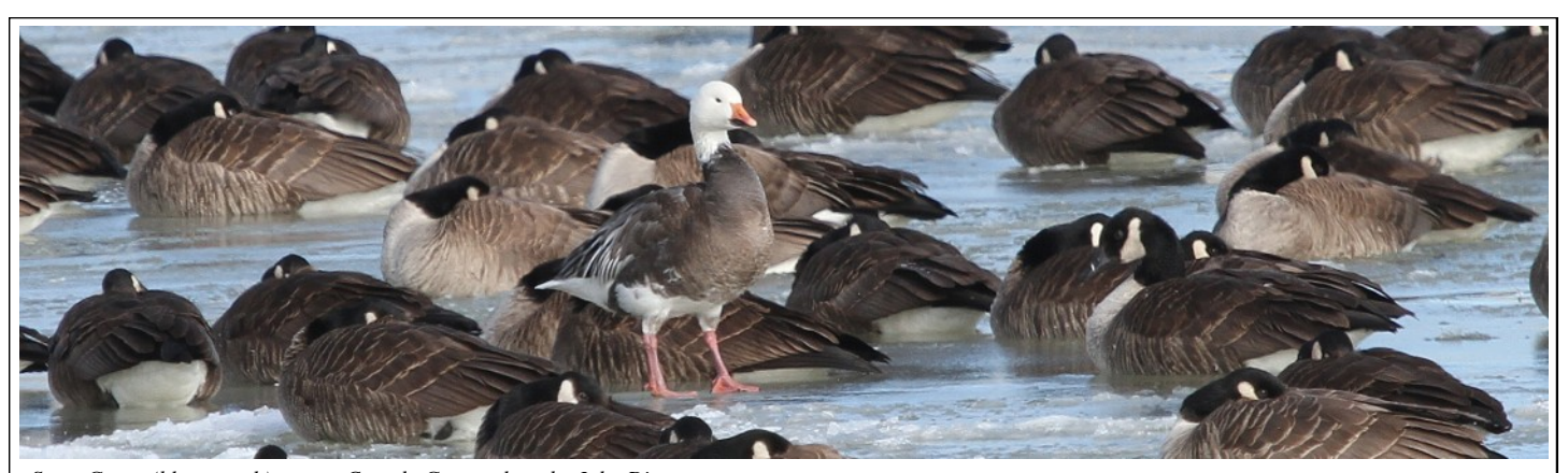
Snow\ Goose\ (blue\ morph)\ among\ Canada\ Geese