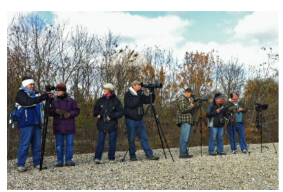
2013 Hoy Audubon Birding at Shoop

Please take the time to renew your Hoy Audubon Chapter