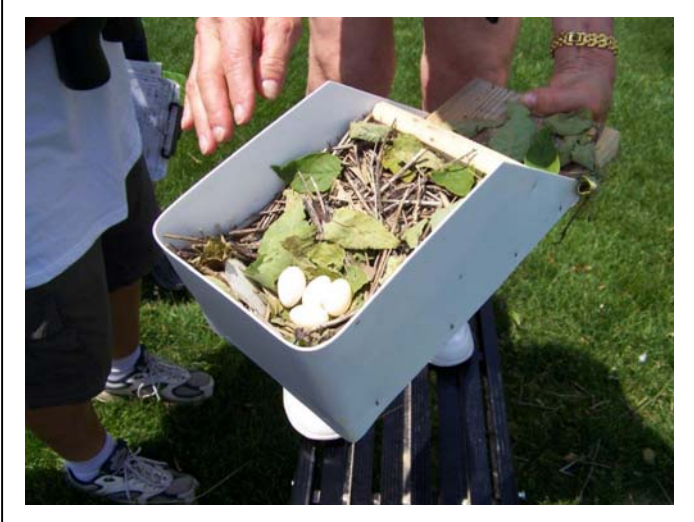
Purple Martin monitoring is a weekly get-together from May through July. The birds emit cheery songs, chortles, and clicks. Their aerial maneuvers are fascinating to watch. If this activity is of interest to you, contact any of the above-mentioned monitors in Racine or Kenosha. They would love to have you join them!

It is an amazing natural phenomenon to watch the nests being built and then count the inch-long eggs and hatchlings. We watch the hatchlings grow into sub-adulthood, sometimes see a first flight, and hope for their successful migration to Brazil and back next spring.