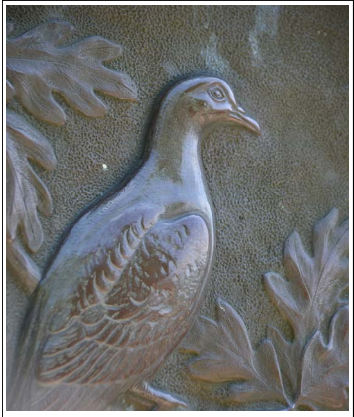
Close up of the Passenger Pigeon Monument

Visit Project Passenger Pigeon at <u>www.passengerpigeon.org</u> to explore facts about the Passenger Pigeon in the United States and Canada, read descriptions of the bird from those who witnessed its thriving and its passing, and learn how you can get involved.