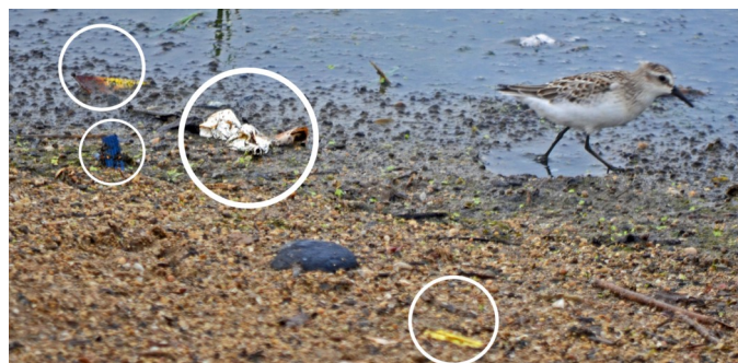
A Semipalmated Sandpiper threads its way through the trash (circled) prior to the cleanup; photo by Kristin Wegner.

Rain was predicted and the sky was overcast, but by 8 a.m., cars had half filled the lot at Myers, and Hoyers were out on the beach, be-gloved, bags in hand, bending to scoop up all manner of unnatural objects. Shorebirds continued feeding, unperturbed, sometimes coming quite close to those who crouched near the water and sifted through the sand.