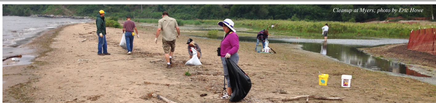
Cleanup at Myers

Annual renewals for Hoy Audubon Society "Chapter Supporter" memberships are due on July 1 of each calendar year. Please send a check payable to Hoy Audubon Society.