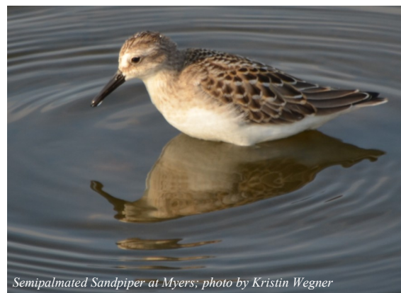
Semipalmated Sandpiper at Myers

Send to: Hoy Audubon Society, P. O. Box 044626, Racine, WI 53404