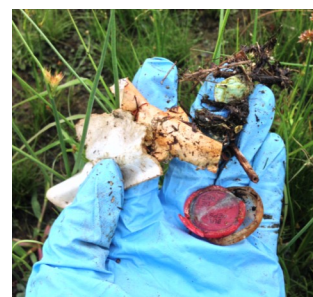
A fistful of typical trash: foam, plastic, wrappers, and bottle caps

Cigarette filters were by far the most numerous offenders; we collected thousands. These and the various broken pens, coffee stirrers, popsicle sticks, and lollipop stems looked so much like bits of driftwood that only way to extract the bad from the good was to comb through the mess with one's fingers. Shotgun wads were beached everywhere, splayed open like miniature squid.