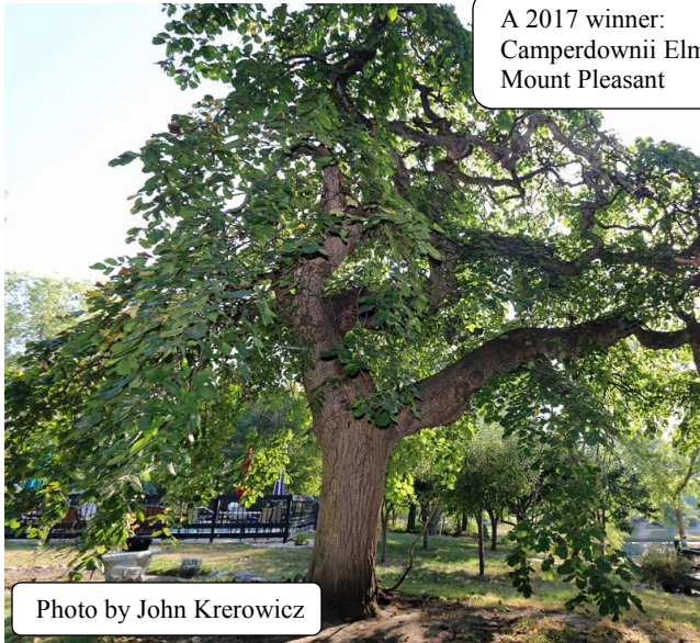
A 2017 winner: Camperdownii Elm, Mount Pleasant

2018 is the third year for the Trees We Love program, a source of celebration, recognition and much-needed positive environmental news. We feel it's a high-impact conservation program with positive, long-term results. Awardees receive permanent recognition, promoting stewardship for, and appreciation of, our beautiful heritage trees.