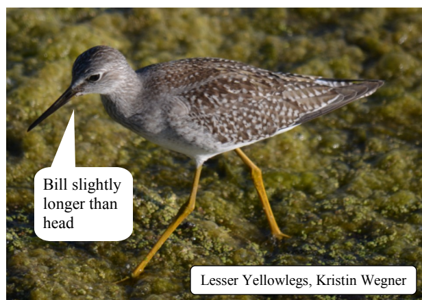
Lesser Yellowlegs

One is the length and appearance of the bill. In the Greater, the bill is quite long, being much longer than the head, fairly sturdy, and usually has the appearance of being slightly upturned. The Lesser's bill is just slightly longer than the head, is rather thin, and is very straight.