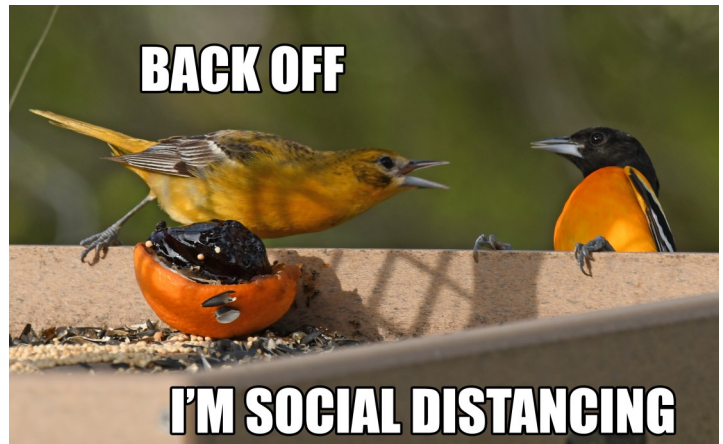
Baltimore Orioles