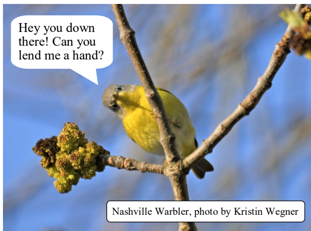
Nashville Warbler

Since we've had to cancel our meetings for the last few months, we have not yet held our annual Board elections. (Many thanks to those who have stayed on extra time while we await our next election!)