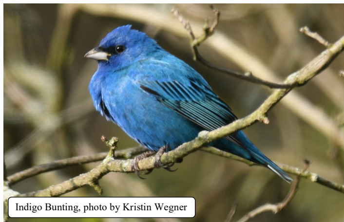
Indigo Bunting

Remember to Renew your Hoy Audubon Society "Chapter Supporter" membership! Dues is $15 per individual for the 2020-2021 membership year and is due on July 1 .