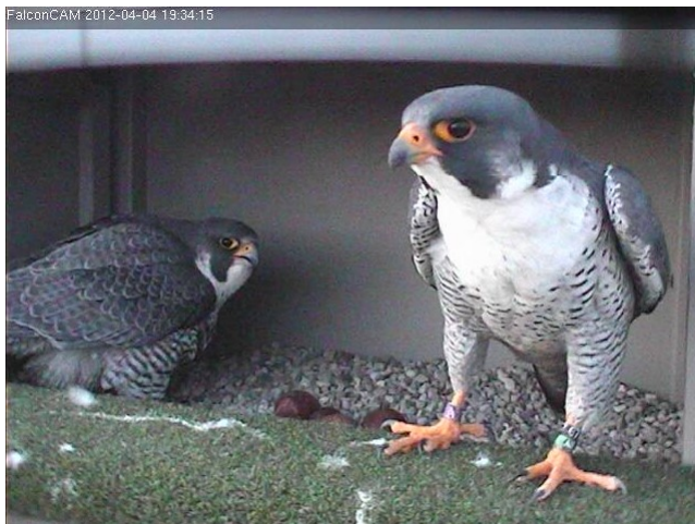
Proud parents R/13 (left) and Beaster (right) on the Racine Falcon Cam in 2012