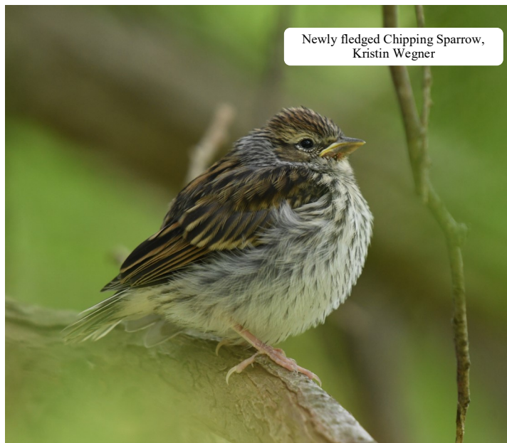
Newly fledged Chipping Sparrow

It is an easy activity for those with limited mobility, as birders watch from a stationary location. Bring binoculars, sunscreen, water, snacks, and a folding chair.