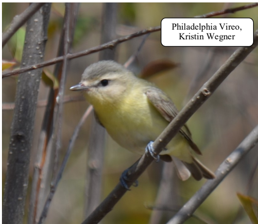
Philadelphia Vireo, Kristin Wegner

On the other hand, the Philadelphia Vireo, which is just a bit shorter than the Warbling, is often a bit plumper in appearance. It has a dark crown which contrasts with the grayish nape and upper back. Its mid and lower back are also a darker shade of greenish-olive. It has a dark eyeline which contrasts more with