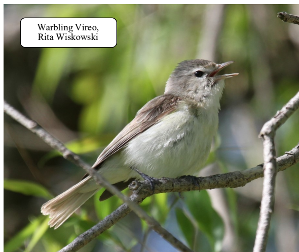
Warbling Vireo, Rita Wiskowski

Let's start with the Warbling Vireo, the more common of the two. It is small, only about 5.5 inches in length, and a rather drab-plumaged bird. It has a greenish-olive back, a light gray crown which blends in color with the nape and upper back, a whitish supercilium, pale lores (the feathers between the eye and base of the bill), a very pale light gray eyeline, and whitish underparts with a slight tinge of yellow on the flanks. Some individuals are a little brighter yellow on the flanks with a bit more extensive yellow plumage than others.