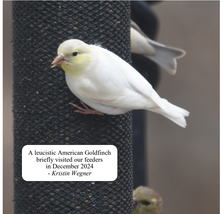
A leucistic American Goldfinch briefly visited our feeders in December 2024 - Kristin Wegner

We'll arrive at Eagle Lake park (north side) at 9:00 a.m. We'll bird the lake then check the wetlands near the intersection of Hwy 11 and 75 on the way back. Check our website / Facebook on the evening of March 20; if the lake is still frozen or has few birds, we may postpone to March 28 (or the week after) and try again!