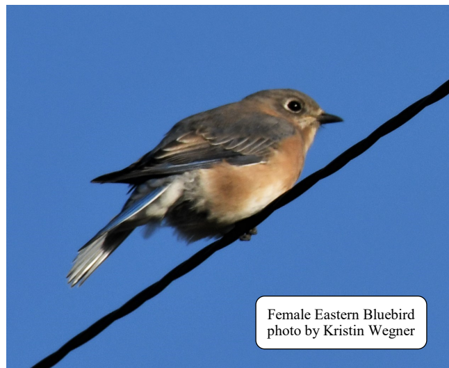
Female Eastern Bluebird

Unfortunately, there was a dramatic drop in the numbers of birds fledged this year compared to last year: