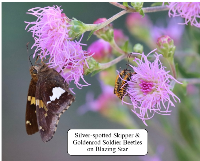
Silver-spotted Skipper & Goldenrod Soldier Beetles on Blazing Star

Here is a list of plants that Rusty Patched Bumble Bees are attracted to! online.flippingbook.com/view/810946527/2/ Winter is a great time to start thinking about spring. What plants could help support pollinators in your yard?