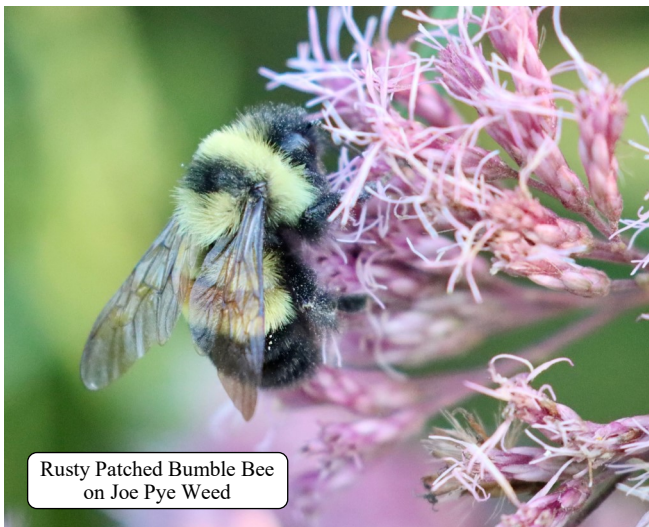
Rusty Patched Bumble Bee on Joe Pye Weed

Every year we add a few new plants to our yard in an effort to attract more birds and pollinators. We have really seen an increase over the years in the numbers of butterflies, skippers, and bumblebees (including the federally endangered Rusty Patched Bumble Bee) in our yard, and I would like to share some of our favorite native plants and some of the pollinators we see on them every year!